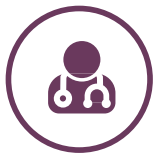
Find a Doctor