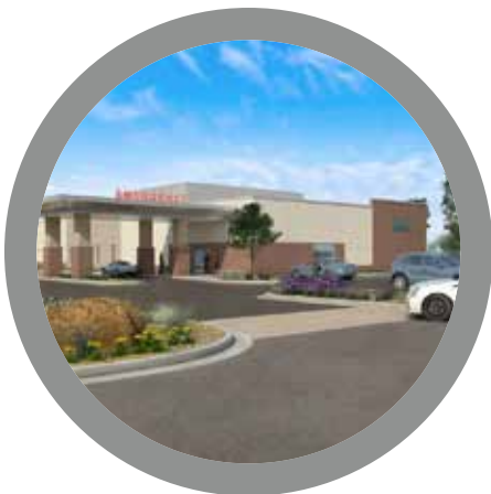
ER at the Lakes 3325 S. Fort Apache Rd. Las Vegas, NV 89117