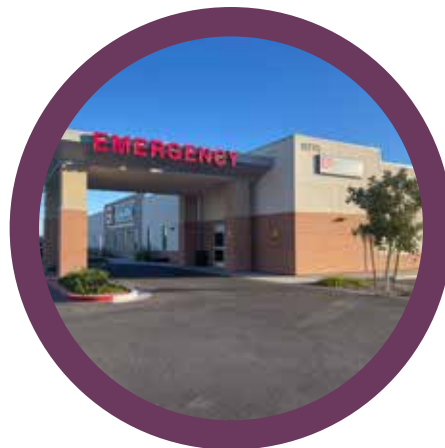
ER at S. Las Vegas Blvd. 10770 Las Vegas Blvd. S Las Vegas, NV 89183