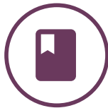
Classes and Events