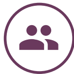
Manage Loved Ones

* Bill Pay excludes anesthesia or emergency physician bills, which are billed separately. Some features may not yet be available in all areas.